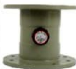
PRC HEX NIPPLE