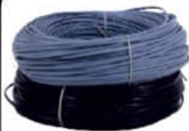
HDPE WELDING ROD