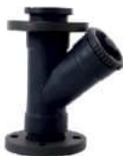
Y TYPE STAINER