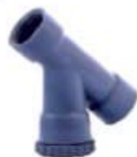
Y TYPE STAINER