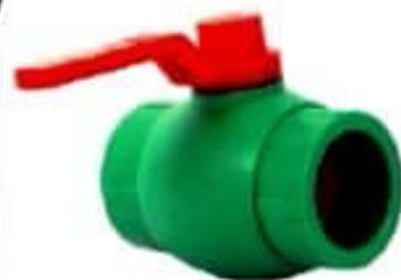
PRC BALL VALVE